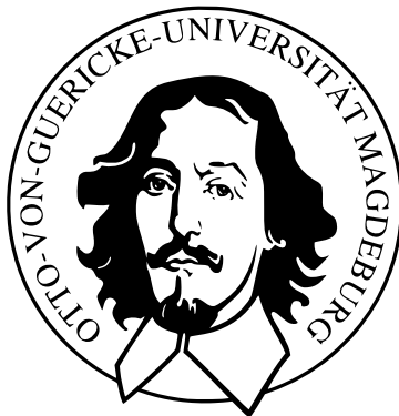
Figure: Logo of the university.