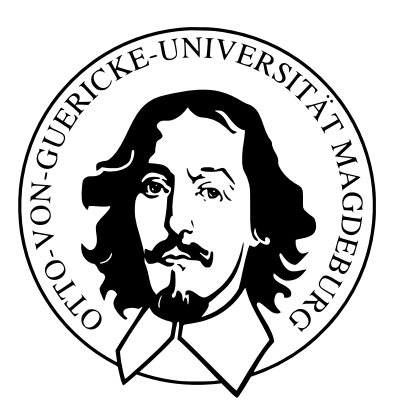
Figure: Logo of the university.